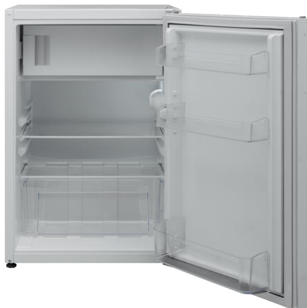
Table top, undercounter